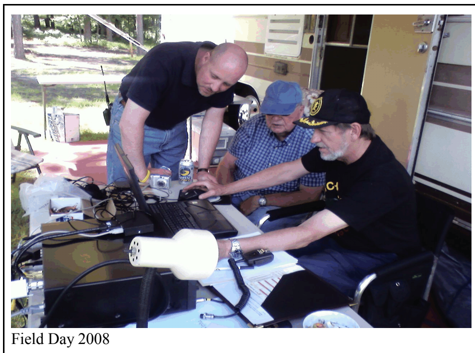
Field Day 2008